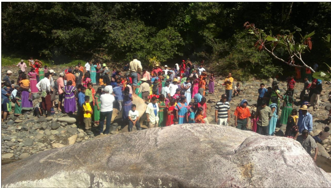
Ngöbe community members camping at Tabasará River in opposition to Barro Blanco project, Feb. 2014

The February 7 th notice identified six additional affected families, or approximately 270 people based on community estimates. The 2012 UNDP report had identified five or six additional families in the indigenous communities that expect to be displaced, not including those community members who reside in the additional areas of flooding later identified in the 2013 UNDP expert assessment. 30