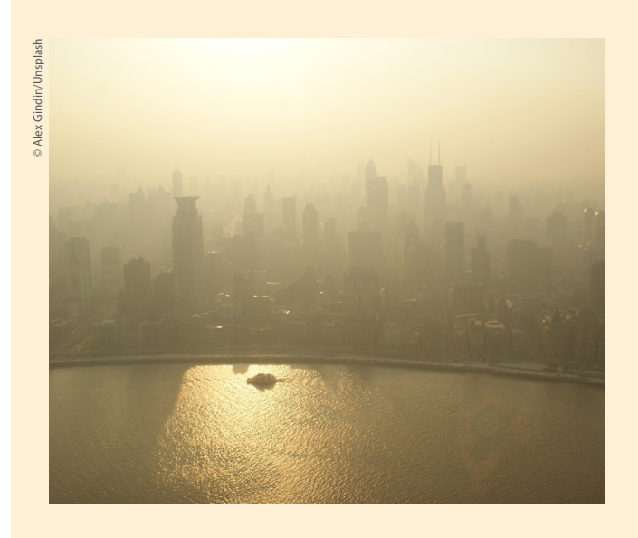
BOX 2 A Note on Carbon Removal Technology

The removal and storage of carbon dioxide as an emissions reduction strategy remains unproven, uneconomic, and highly risky.<sup>180</sup> Even assuming such technologies could be deployed at the massive scale envisioned and promoted by industry today, and that the immense impacts to land, water, communities, and human rights attendant to that deployment could be addressed, the prospects for keeping massive quantities of CO<sub>2</sub> effectively buried for thousands of years are extremely uncertain.<sup>181</sup> Moreover, the oil industry's long promotion of carbon capture as a tool for extracting additional oil and gas from the ground through "enhanced oil recovery" makes the potential benefits for the climate illusory at best. Nonetheless, had technologies for removing CO_2 from waste streams been seriously deployed more than four decades ago—and their attendant costs properly factored into the costs of burning fossil fuels—both the scale of the climate crisis and the economic externalities that effectively subsidize oil and gas combustion might have been reduced.