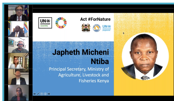
Japheth Micheni Ntiba, Minister, Kenya