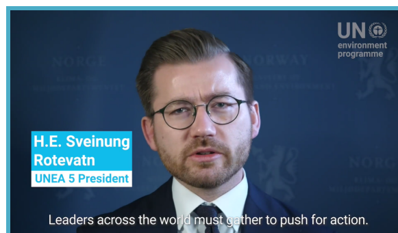
H.E. Sveinung Rotevatn, President of UNEA5

"The push for a legally binding agreement has gotten ever stronger over the past year. A lot of countries, including my own, are pushing for a new agreement. There is a lot of momentum, which is a good thing."