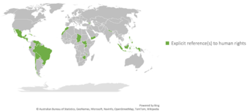
Explicit references to human rights in updated NDCs / second NDCs