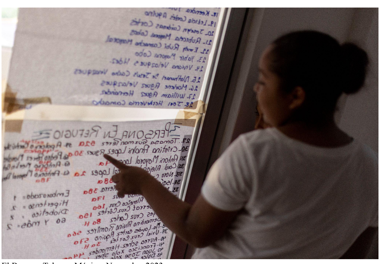
El Bosque, Tabasco México, November 2023