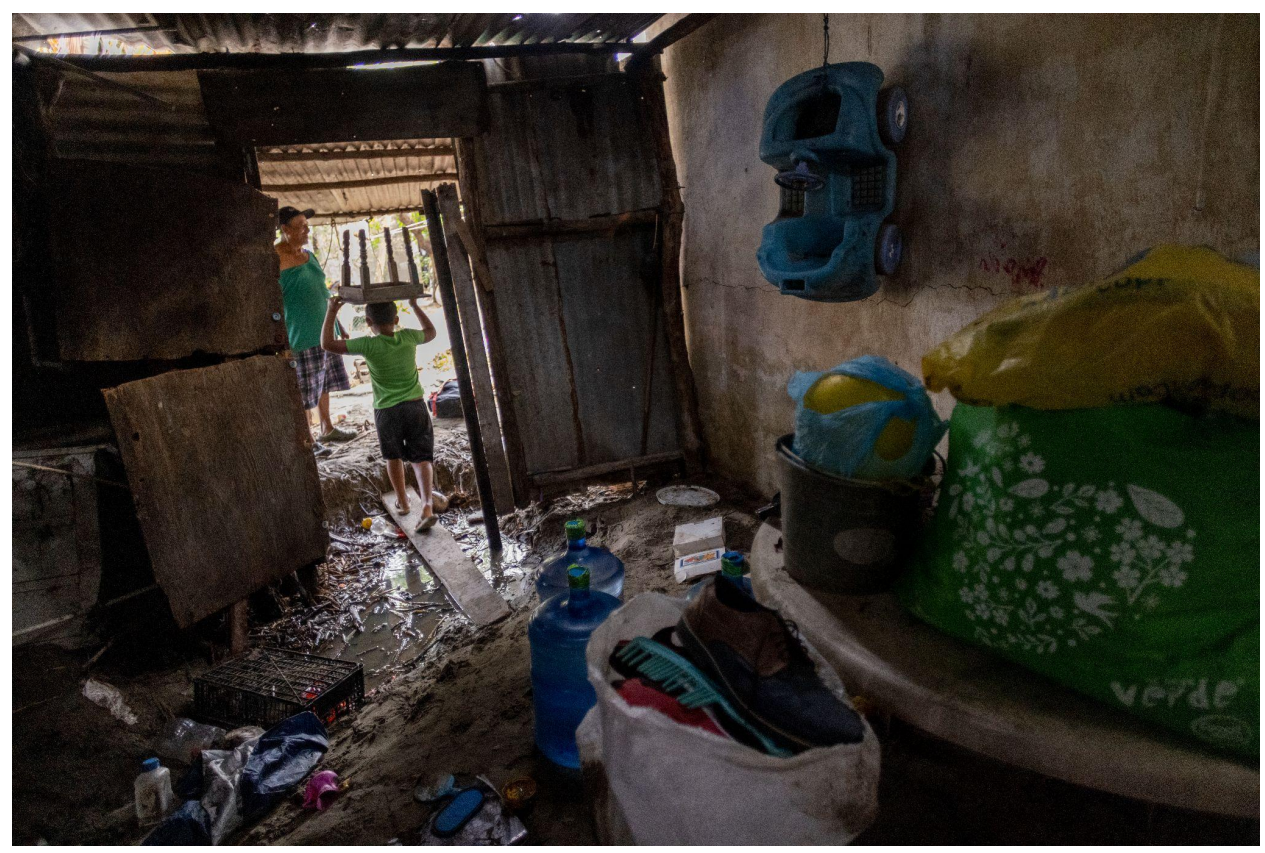
El Bosque, Tabasco México, November 2023.

The community of El Bosque is demanding that the relocation is fair, dignified, and participative.