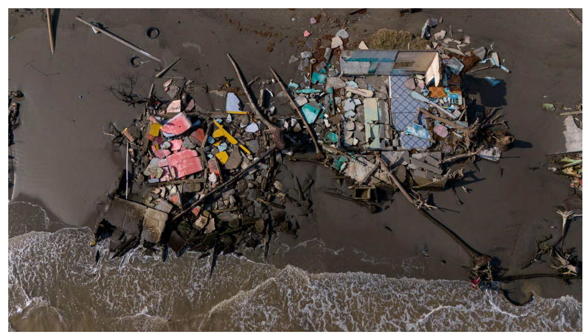
El Bosque, Tabasco México, November 2023.

Tabasco State, in Mexico, is one of the most vulnerable to the impacts of the climate crisis. El Bosque community is located in the peninsula between the Grijalva River and the Gulf of Mexico. For approximately five years, the El Bosque community has been experiencing first-hand the disproportionate impacts of climate change. Accelerated sea level rise, coastal erosion and floods caused by heavy rains and other extreme weather events have devastated the community, displacing over 30 families and leaving 20 others in immediate danger.